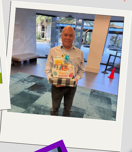
Golden Egg Hunt 🥚