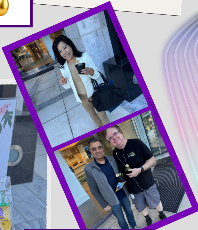
Earth Day 🌍