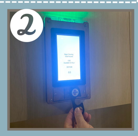
Scan your tap key at bottom of screen