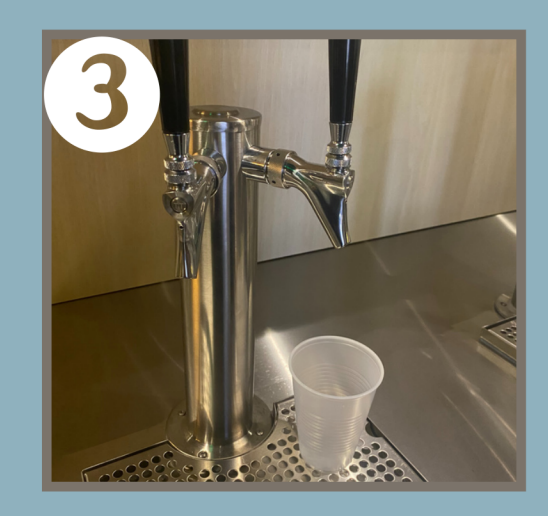
Place cup under desired tap