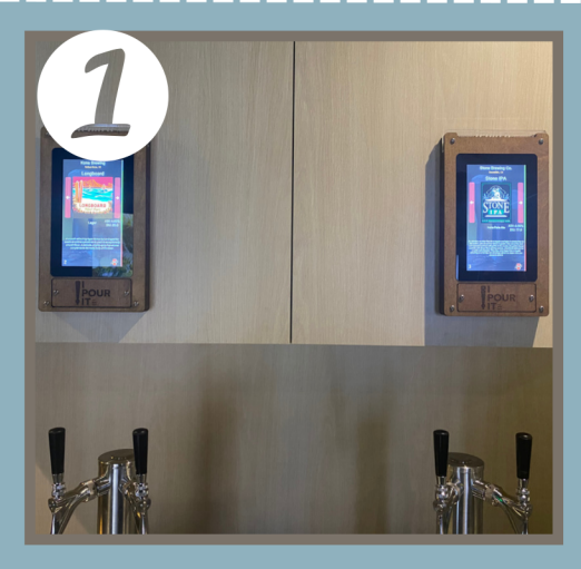
Browse screens to find your beverage and note Tap Number

Tap Keys may be obtained from security located in the building lobby Monday - Friday between 9 AM - 5 PM