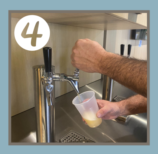
Pull tap forward to dispense and back in place when finished